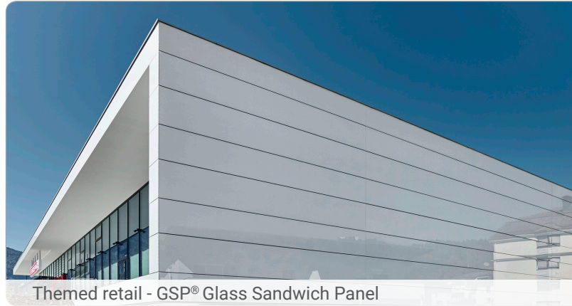
Themed retail - GSP® Glass Sandwich Panel