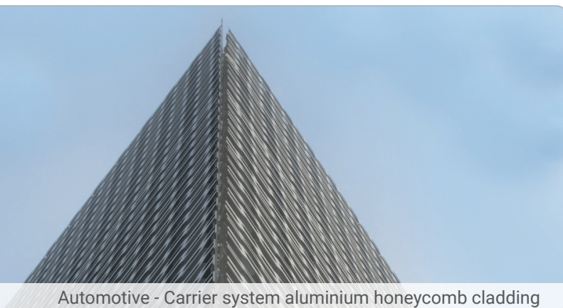
Automotive - Carrier system aluminium honeycomb cladding