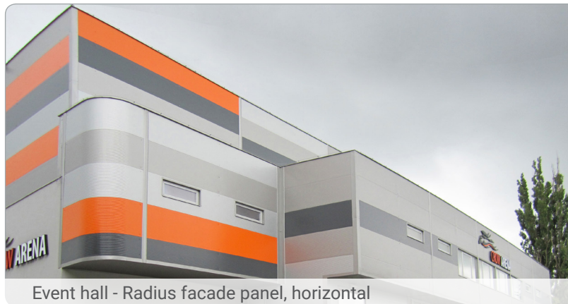
Event hall - Radius facade panel, horizontal

We are looking forward to hearing from you and being inspired by your ideas!