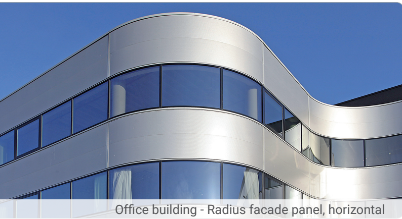
Office building - Radius facade panel, horizontal