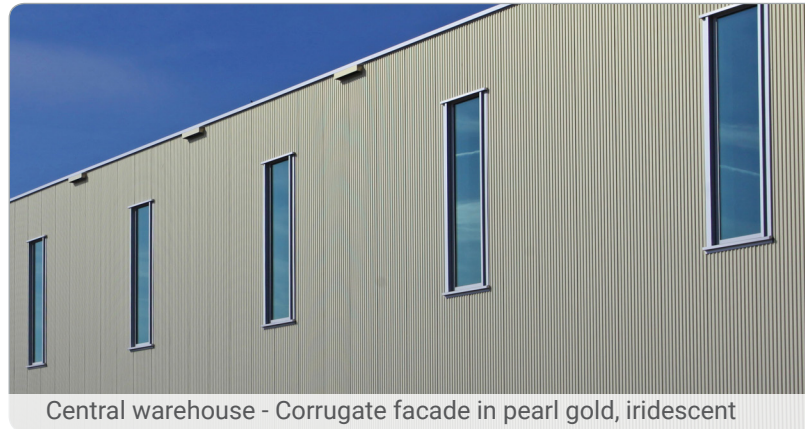
Central warehouse - Corrugate facade in pearl gold, iridescent