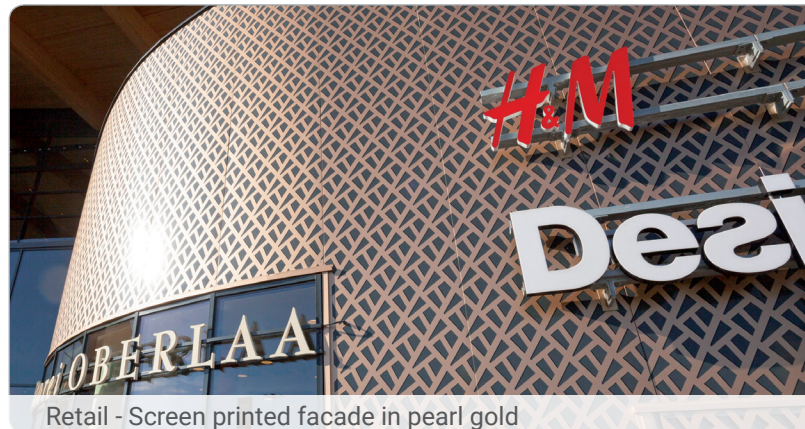
Retail - Screen printed facade in pearl gold