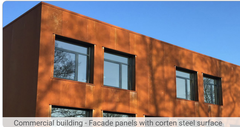
Commercial building - Facade panels with corten steel surface