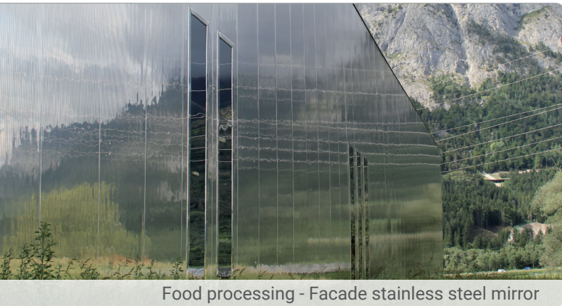
Food processing - Facade stainless steel mirror